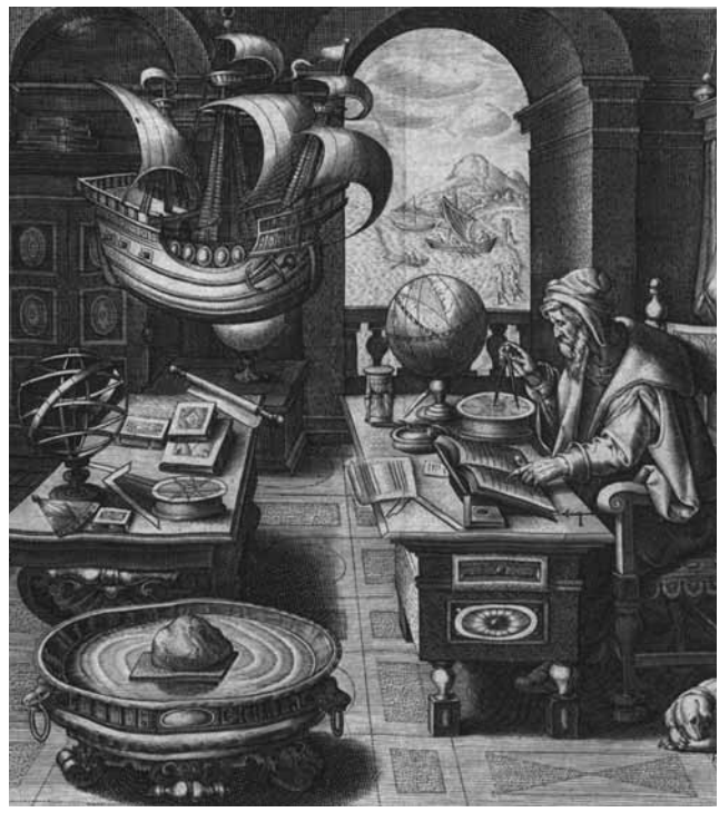
Date: 29 August 2010 to 4 September 2010.

The summer schools are aimed at PhD students undertaking any aspect of early modern research. Lectures and workshops will be held in English.